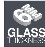
6mm Glass Thickness