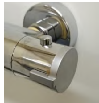
9. Re-fit the Temperature Handle Concealing Cap.