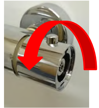
6. If the pre-set temperature is too cold, turn the handle towards the hot and wait approx. 10 seconds.