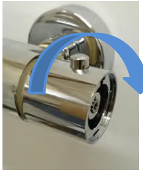
5. If the pre-set temperature is too hot, turn the handle towards the cold and wait approx. 10 seconds.