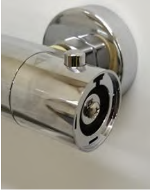
1. Remove the Temperature Handle Concealing Cap.

Note: The Temperature handle fixing method will slightly vary depending on type.