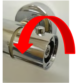
6. If the pre-set temperature is too cold, turn the handle towards the hot and wait approx. 10 seconds.