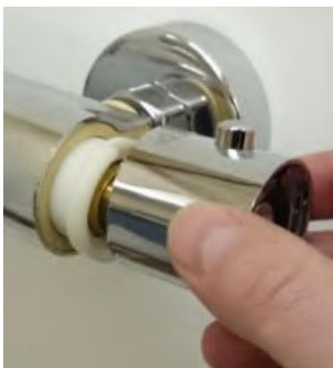
7. Once the Shower is set to the desired temperature, relocate the Temperature Handle onto the Cartridge spline, ensuring that the Over-ride Button Pin is against the Temperature Stop Lug. (This prevents the temperature from exceeding 38°C unless the Over-ride button is pressed)