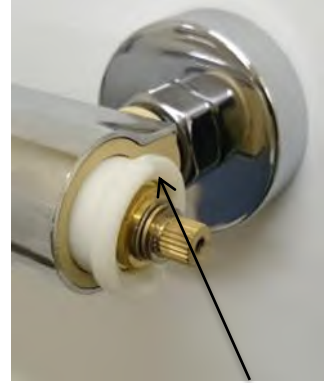
3. The Temperature Stop Lug and Cartridge Spline are now visible.