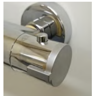
9. Re-fit the Temperature Handle Concealing Cap.