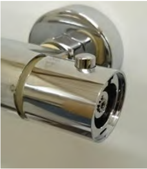
4. Relocate the Temperature Handle back onto the Cartridge Spline by approx. 3mm.