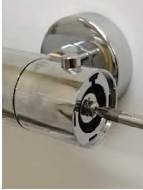
2. Using a X-head screwdriver remove the Temperature Handle.