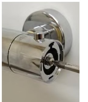
8. Again using a X-head screwdriver secure the Temperature Handle.