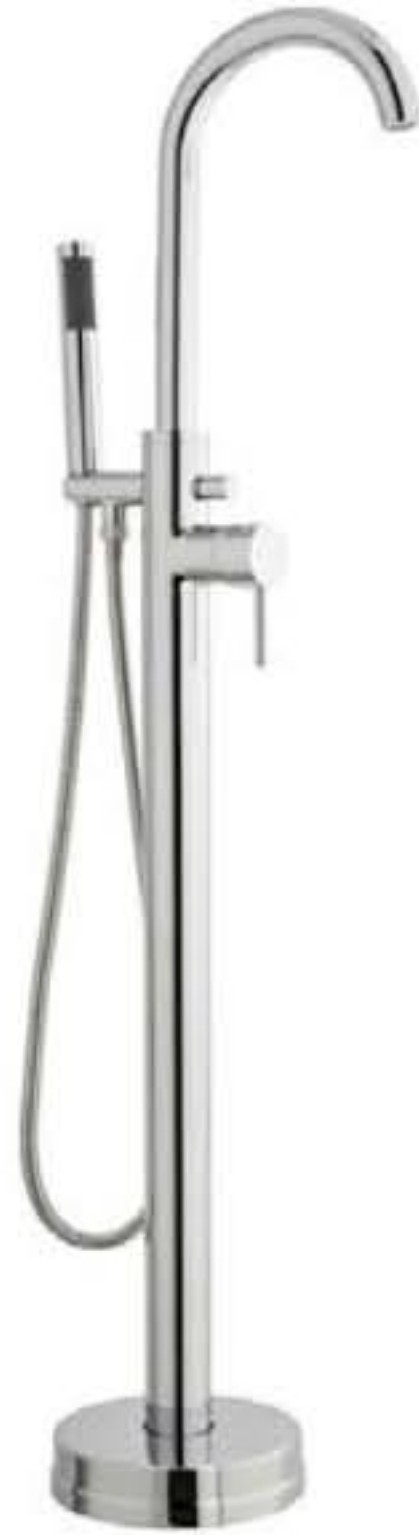
ILLUSTRATION: PLAN FREE STANDING B/S MIXER