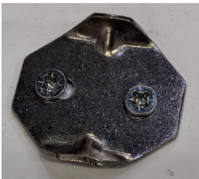
Wall Mounted Fixing Plate - SP19823