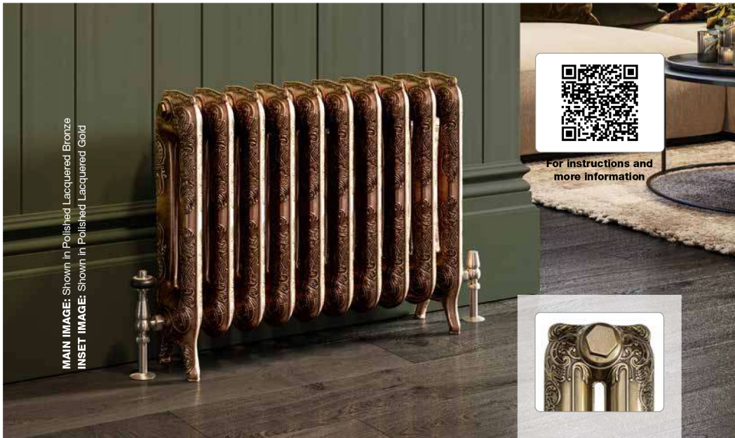
MAIN IMAGE: Shown in Polished Lacquered Bronze INSET IMAGE: Shown in Polished Lacquered Gold