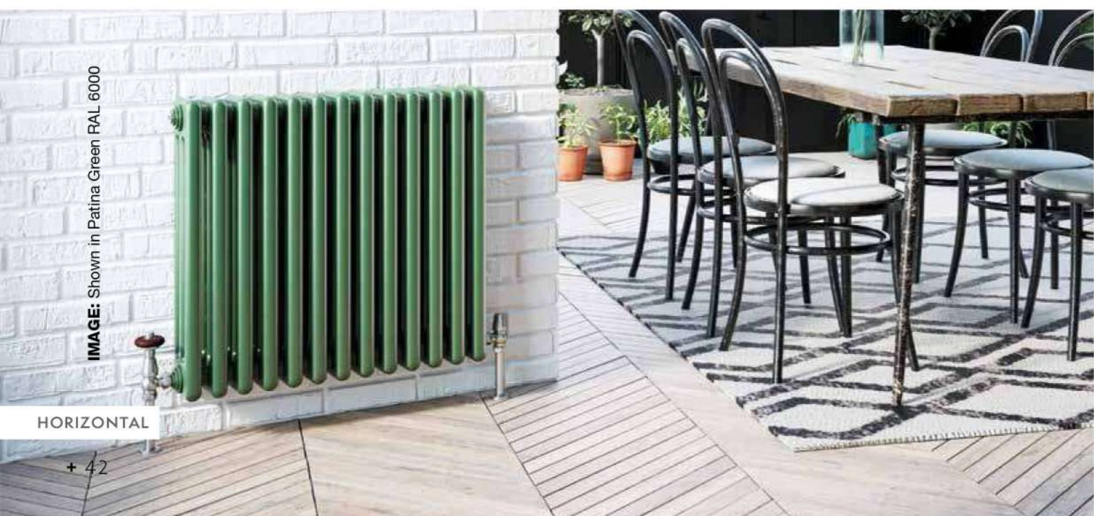
IMAGE: Shown in Patina Green RAL 6000

For the most accurate and current lead times, please contact the sales team.