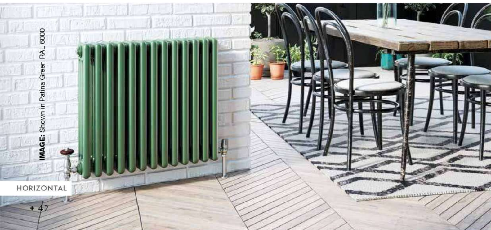
IMAGE: Shown in Patina Green RAL 6000

For the most accurate and current lead times, please contact the sales team.